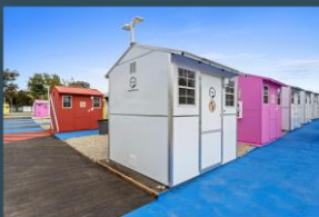
Pallet Homes for Arbor of Hope East Campus

City of Temple Housing & Community Development Dept. 101 North Main Street Temple, TX 76501 254-298-5999